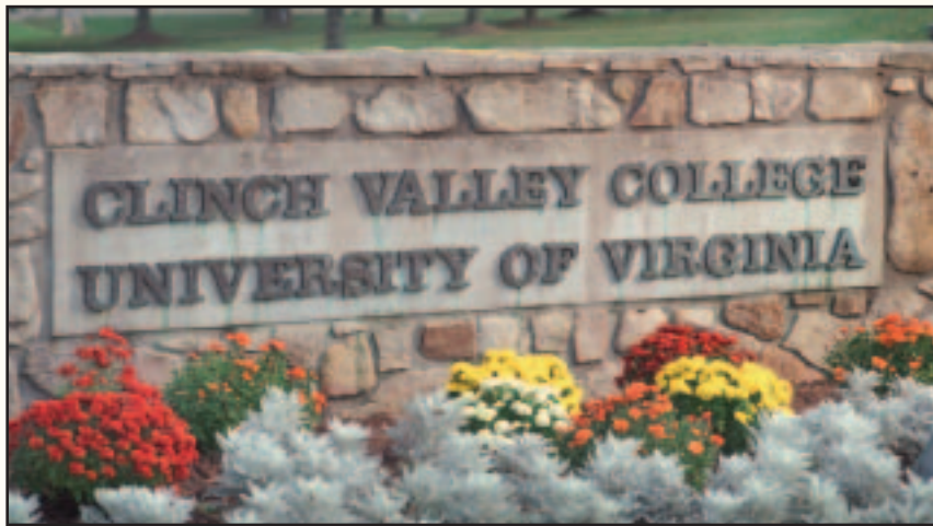
The entrance to the College before July 1, 1999.

The University's student newspaper, the Cavalier Daily , endorsed the call for a name change enthusiastically, noting, "Without a reason to reject CVC's proposal, and with a number of reasons to accept it, the Board's decisions [sic] should be a simple one."