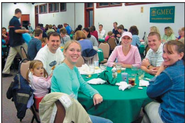
Head for the Hills 2005

GMEC is a nonprofit corporation governed by a volunteer board of directors and managed by the University of Virginia's College at Wise. Our mission is to improve access to high quality primary care by forging links between local doctors, communities and graduate medical education programs.