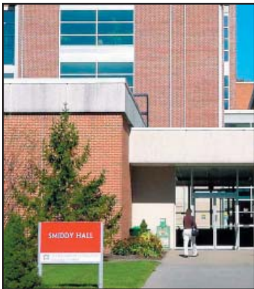
The GMEC office is in Smiddy Hall on the campus of the University of Virginia's College at Wise.

Phone: 276-328-0249 Fax: 276-328-0295 Email: lal8s@uvawise.edu Web: www.uvawise.edu/gmec